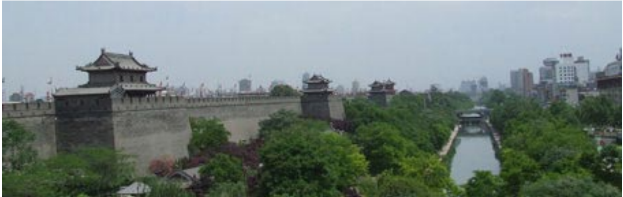
Xi'an City Wall