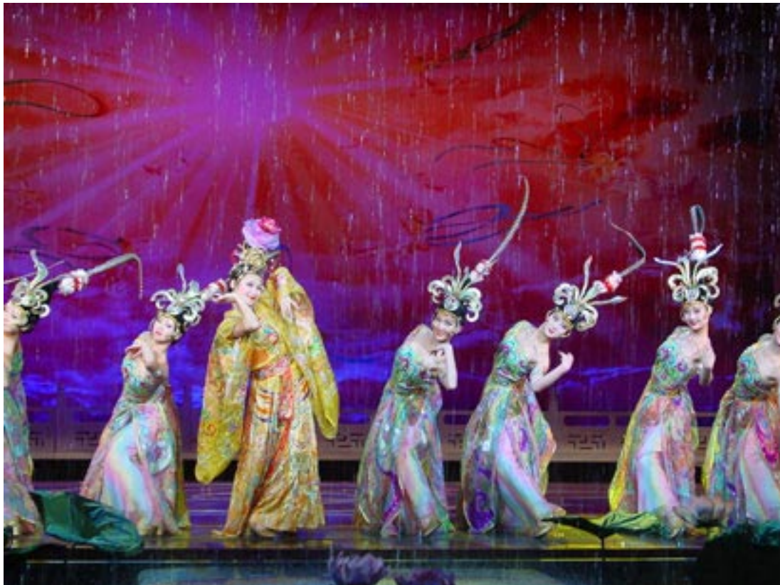
Scene from the Tang Dynasty Performance

Finally, we fully endorse the new idea developed during this Xi'an Forum of launching the Silk Road Cultural Month, which proposes to focus on better understanding of cultural issues in the region with cultural performances and exhibitions moving from Xi'an to Xinjiang to Central Asia and commencing in May – June 2007.