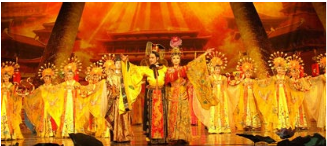
Closing scene from the Tang Dynasty performance