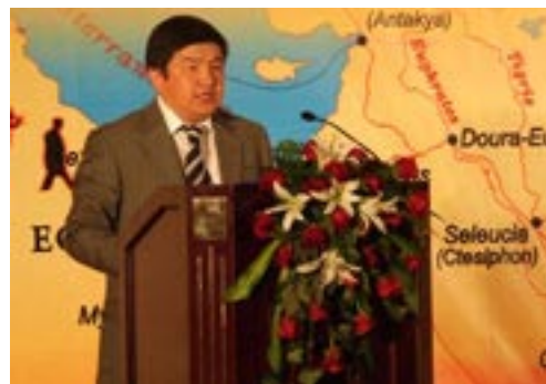
Akylbek Japarov, Minister of Economy and Finance of the Kyrgyz Republic

The Forum also produced some business partnerships with the Chinese computer company Lenovo signing a letter of intent with the Ministry of Communications in Kazakhstan leading to a contract for 500 sets of computers (with the final agreement to be signed shortly after the Forum). Lenovo will set up a representative office in Kazakhstan. A tractor producer from China started discussions on possible cooperation with an Uzbek partner, and another Chinese company opened talks on real estate cooperation with a prospective partner from Kazakhstan. An Uzbek private sector company identified a partner in Xi'an that will cooperate in retail packaging and distribution of Uzbek products in China.