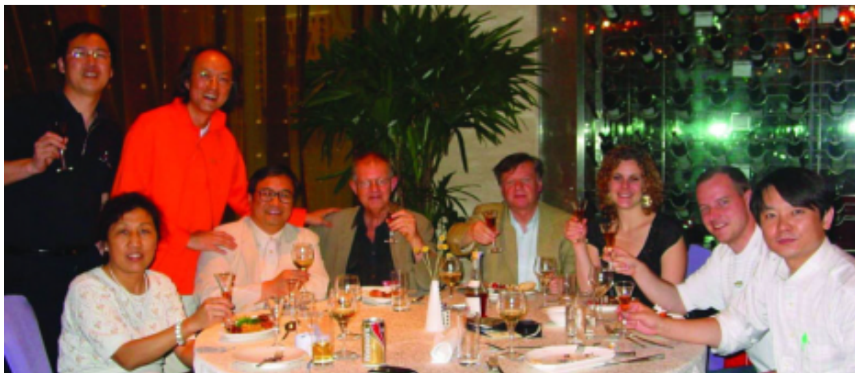
Silk Road Investment Forum in Xi'an: After the closing ceremony. The Silk Road Initiative (SRI) team and its closest collaborators (left to right):

Silk Road Regional Investment Forum in Bishkek, Kyrgyz Republic