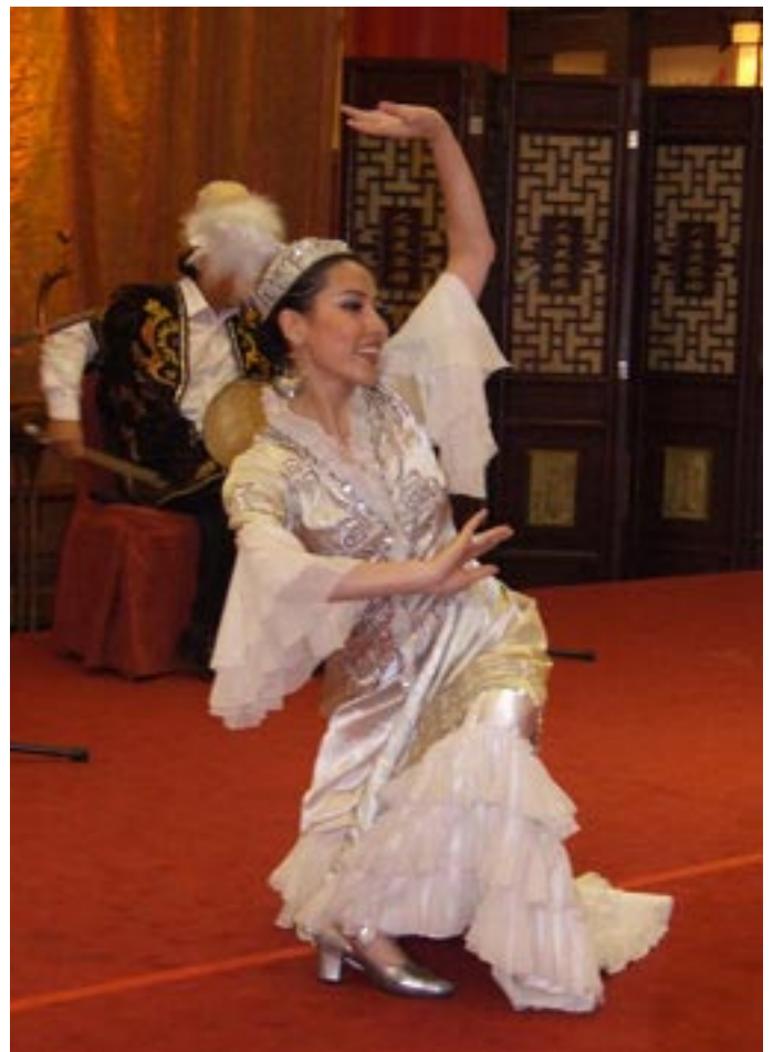
Dancer from Kyrgyz Republic