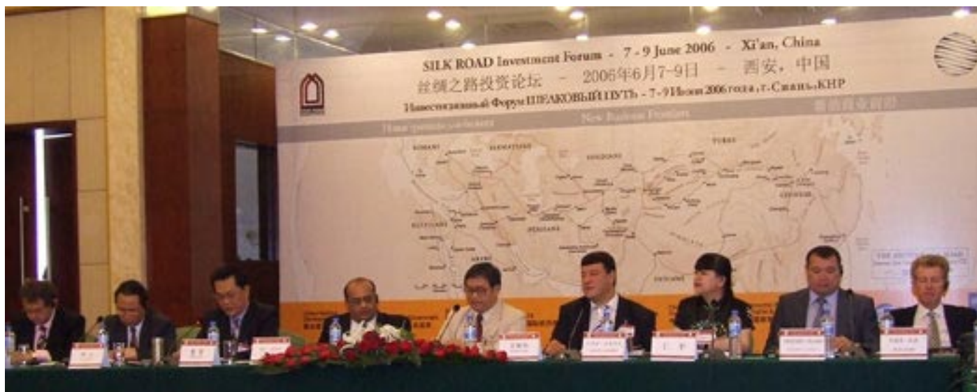
Tourism development panel

Session summarized by Natalia Maximchuck