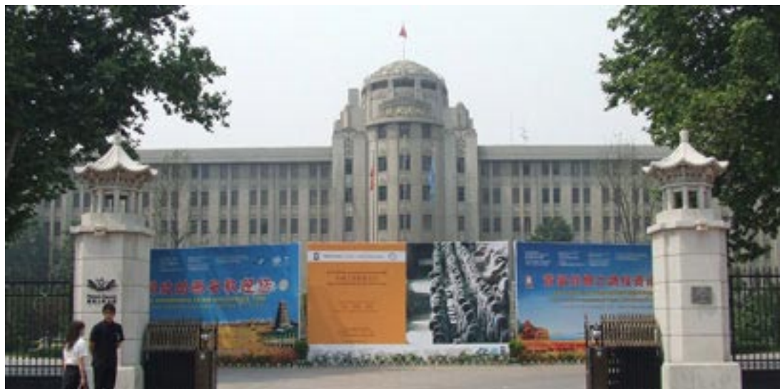
Gate to the Renmin Square compound

On the second day of the forum, session II was divided into four simultaneous groups; agro-based industries; transportation, transit, logistics and IT; tourism development; and energy and mining. Findings for each sector, as summarized during the closing ceremony, are presented below.