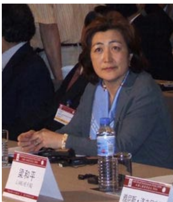
Yuriko Shoji, UN RC and UNDP RR Kazakhstan

Lately Kazakhstani people have also been increasingly exposed to the USA and Europe, but it sees Japan as an East Asian economic leader.