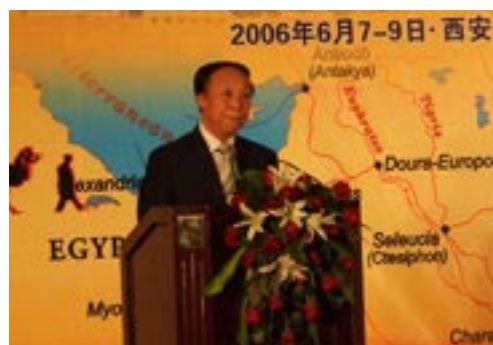
Mayor of Xi'an, Sun Qingyun

In addition, SRI hired a publishing house to produce a Silk Road map (distributed in mini format at the Forum), including an old map showing the variety of routes from China to Europe, and a contemporary map depicting the four central Asian countries and western China, for easy reference of the area.