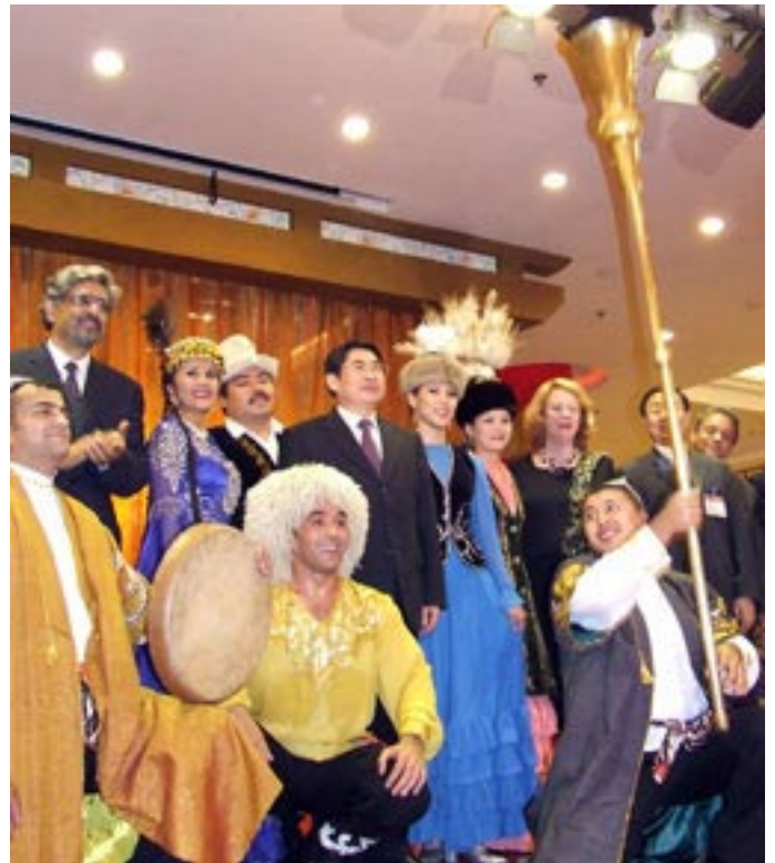
Central Asian performers

They are balancing their relationship with the international players, and in particular between China and Russia through its membership of SCO and EURASEC. Regional cooperation in Central Asia is an active, on-going issue. Countries such as Kazakhstan and Uzbekistan both see themselves in a leadership role.. But in any event, it is a fast growing and fascinating region.