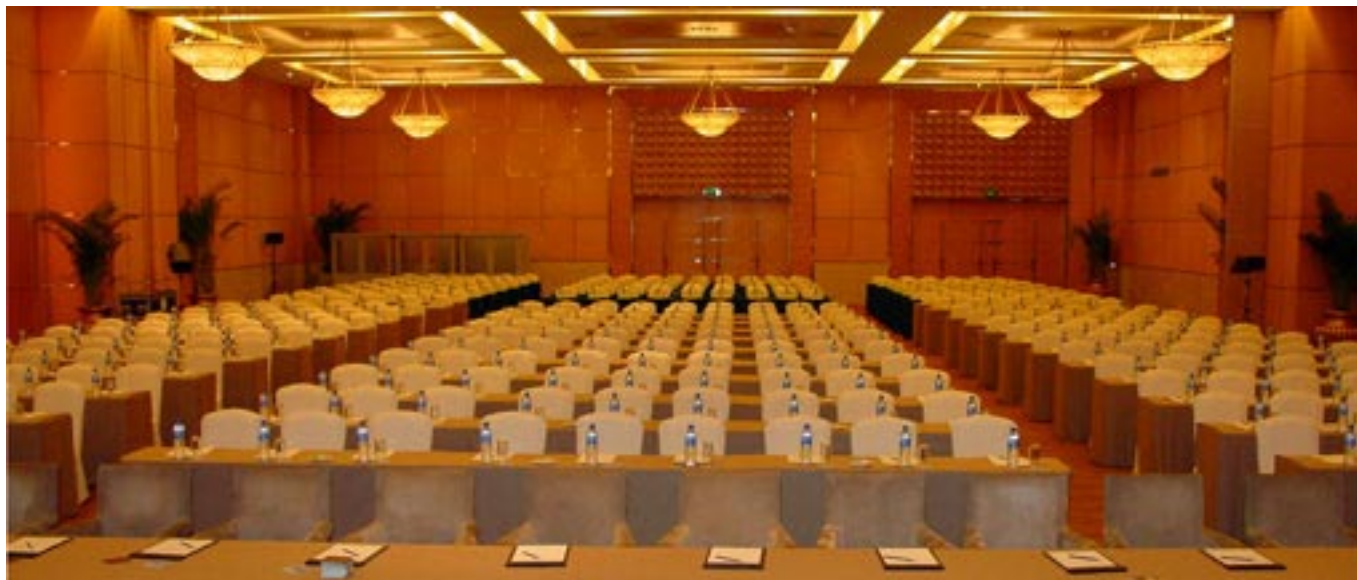
The conference room ready for the opening

The first regional Silk Road Investment Forum took place in the ancient city of Xi'an on June 7-9. Aimed at revitalizing old Silk Road trade traditions, the forum brought together, for the first time, public and private sector representatives, primarily from China and Central Asia, but also from neighbouring countries and beyond, for discussions on regional investment opportunities.